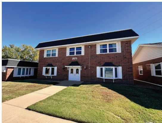
Upper Level Suite - 1800 SF Includes Kitchenette