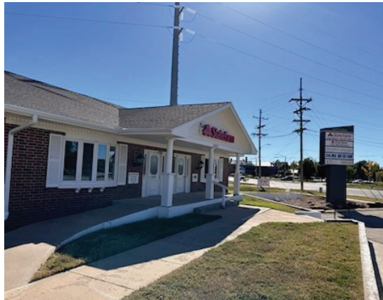
Main Level Suite - 1200 SF

Neighbors include: Comcare, Bank of Tescott, Sunflower Bank, Waddell & Reed Financial Svcs, Bennington State Bank, Great Plains Federal Credit Union